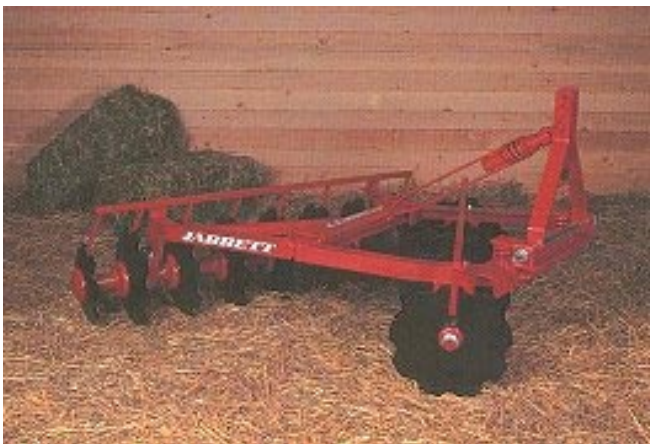
The BS1618 linkage disc cultivator