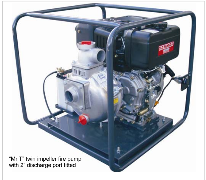
"Mr T" twin impeller fire pump with 2" discharge port fitted

Engine options include 7HP (recoil & electric start options) or 10HP electric start Yanmar diesel engines.